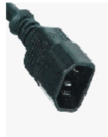
IEC320 C14 10A plug